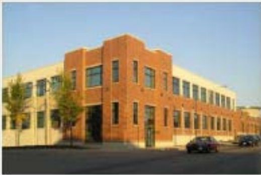
Hope High School Milwaukee, WI

Cost of Choice to tax payers: $6,500 per student